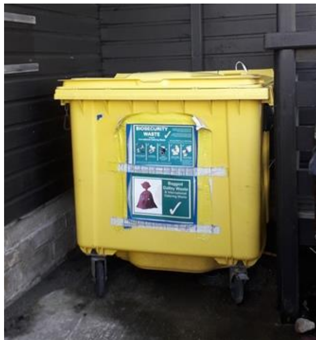
Figure 2: International Catering Waste bins are yellow and marked with an ICW sign.

For vessels or yachts at other moorings, ICW is to be sealed in the biohazard bags issued to you by Customs upon entry to the Falklands. Customs will collect the bags for safe disposal upon clearing your vessel to depart. Alternatively, ICW can be disposed of at the Department of Agriculture, in bins situated in the corner of the car park (a sign indicates the bin is for biosecurity material).